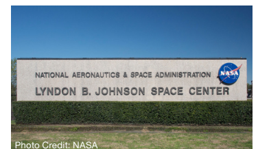
The Lyndon B. Johnson Space Center is NASA's premier facility for human spaceflight, established in 1961 as the Manned Spacecraft Center and renamed in 1973. It manages astronaut training, mission control for the International Space Station (ISS), and development of the Orion program.