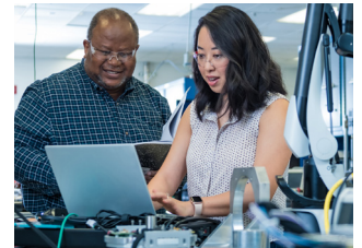
System of Systems Engineering and Integration