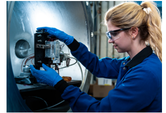
Concept Development and Prototyping