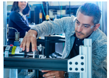
The Vehicle Systems Division (VSD) provides engineering solutions to the nation's vehicle system challenges when and where they are needed.