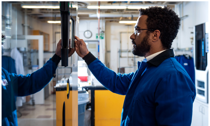
In the Additive Manufacturing Laboratory, an Aerospace scientist studies the relationship between the processing, structure, properties, and performance of 3D printed parts.

Building on its early success, UPLIFT has recently been expanded to include all Aerospace technical disciplines. While the primary goal is to facilitate connections between outstanding talent from across the nation and Aerospace professionals, UPLIFT also offers career development and recruitment opportunities for participants.