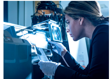
A researcher inspects data associated with the material science of a critical space system in a unique laboratory at Aerospace.

Note: All Aerospace employees working in organizations with technical responsibilities are required to apply for and maintain at least a Secret clearance. U.S. citizenship is required for those positions.