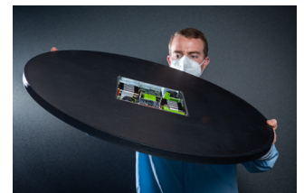
DiskSat is a plate-shaped satellite (1 meter in diameter, 2.5 centimeters thick) that could provide the required power and aperture needed for future missions.