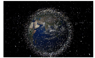
Space Domain Awareness