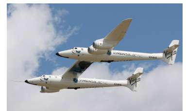
Space Systems and Launch