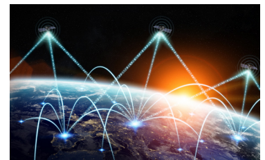
Requirements & Architecture