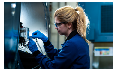
Independent Technical Assistance