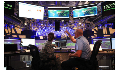
Space Policy and Strategy