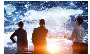
Accelerate execution by informing space regulations and standards