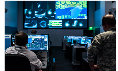
Identify, align, and connect commercial solutions to national needs

The Aerospace Corporation is a leading architect for the nation's space programs, advancing capabilities that outpace threats to the country's national security while nurturing innovative technologies to further a new era of space commercialization and exploration. Aerospace's national workforce of more than 4,600 employees provides objective technical expertise and thought leadership to solve the hardest problems in space and assure mission success for space systems and space vehicles. For more information, visit www.aerospace.org .