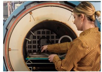
Technology Development and Prototyping: Replicated composite optics are fabricated to be lightweight, reducing manufacturing time and cost.

Technology Development and Prototyping: Innovative Replicated Optics. A PSL team has been using replication technology and lightweight materials to create high-precision optics free from traditional mirror grinding or polishing requirements and much lighter in weight. Scientists in our materials lab use lightweight composites and Aerospace-patented protocols to produce these mirrors and have conducted rigorous experimental investigations of stress relief and stabilization of the optics with extreme humidity exposure tests. This realistic handling and exposure has dramatically improved the confidence in mirror performance, cutting both weight and production times, and fundamentally improving acquisition tradeoffs for next-generation space systems.