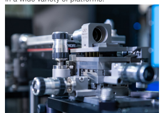
Advanced Concepts: Aerospace has built a fully functioning quantum cryptographic lab.

Advanced Concepts: Quantum Photonics Technologies. Quantum technologies use the properties of atoms and photons to measure or produce phenomena fundamentally inaccessible with classical systems. Quantum properties can be exploited to perform secure communications, signal-to-noise enhanced sensing and imaging, parallelized computing, and other applications that can significantly impact the implementation and operation of space assets. The quantum cryptographic lab features several custom analytical and numeric toolsets for the analysis of quantum photonics-based systems. The team has built multiple testbeds for the evaluation of photon sources and detectors integral to the implementation of photonics technology.