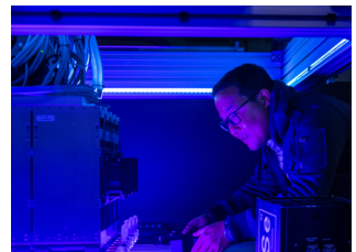
Rapid and Agile Acquisition: Aerospace has developed a miniaturized test platform to measure the performance of solar cells above the ozone layer to calibrate the solar simulator in the lab.

Science-Enabled Agility: Accurate Space Photovoltaics Characterization for Advanced Technology Infusion. Solar cells and solar arrays are among the most vulnerable and costly subsystems for a spacecraft. As acquisition cycles shorten and threats become more dynamic, Aerospace is responding with agile mission assurance processes supported by state-of-the-art solar cell characterization and prototyping. Our space photovoltaics expertise has been critical to the development of the Aerospace Measurement Unit, which combines high-precision zero-drift analog circuitry with low power digital electronics to allow for laboratory-grade measurements of current, voltage, temperature, and solar illumination angle at a fraction of the size of a traditional test setup. Customers can characterize the on-orbit performance of advanced solar cell technologies in the lab, allowing for quicker infusion of advanced technologies into space systems.