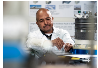
Resiliency and Space Warfighting R&D: Our Hyperspectral Imaging lab sensors are embedded in a wide variety of platforms.

Resiliency and Space Warfighting Research and Development: Space Domain Awareness Enabled by Sensors on the Ground and in Space. The Remote Sensing Department has decades of experience in both developing sensors and collecting data in all wavelengths of light, from visible to infrared. Our sensors are embedded in a wide range of platforms, ranging from some of the largest telescopes on the planet to the smallest cubesats on orbit. These systems serve as testbeds, calibration sources, and data collection sources to enhance our customers' insights into operational environments and to provide options for mission execution.