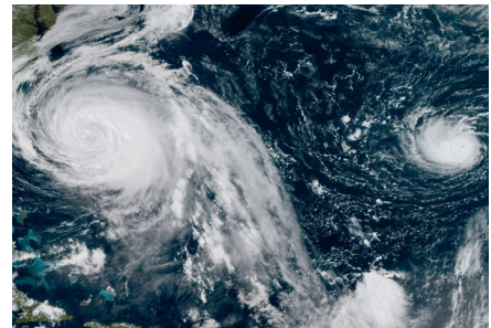
Project NOAA Data Analytics is working to increase the resilience of severe weather models based on complex data inputs.

DARPA's experimental low earth orbit (LEO) satellite constellation program, known as Blackjack, is an architecture demonstration intending to develop and demonstrate the critical elements of a global high-speed network in a LEO constellation. In addition to providing highly connected, resilient and persistent coverage, Blackjack's mission includes the demonstration of payloads to augment existing national security space assets in LEO. Key to the Blackjack objectives are payload- and mission-level autonomous, robust and resilient capabilities for orbital operations. Pit Boss, the autonomous subsystem for these operations, is intended to develop autonomy, integration, on-orbit cyber security and on-orbit cryptographic solutions for the Blackjack constellation. As the independent trusted advisor to government, Aerospace is providing independent evaluation for the Pit Boss source selection, helping to identify concepts most likely to succeed in solving DARPA's defined "hard problems."