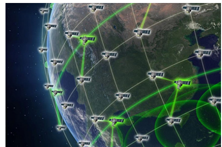
Artist's concept of the Blackjack constellation on orbit.