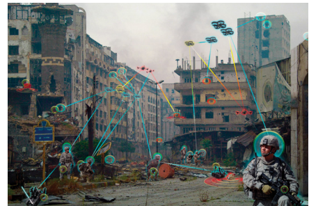
To cut through the noise and increase the speed at which electronic warfare officers can identify and react to signals on the battlefield, the Army's Rapid Capabilities Office (RCO) sought new technologies that apply artificial intelligence and machine learning to paint a picture of the electromagnetic spectrum for the Army Signal Classification Challenge.