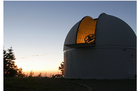
Catalina Sky Survey's 60-inch telescope atop Mount Lemmon.