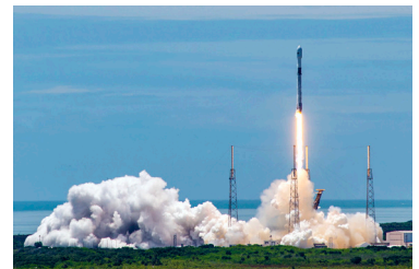
GPS III-5 launched aboard a SpaceX Falcon 9 from Cape Canaveral SFS.