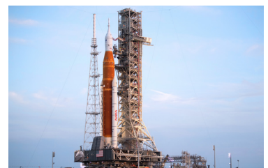
NASA's Space Launch System (SLS) rocket.