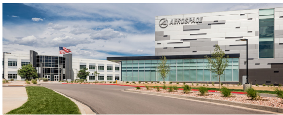
The new Colorado Springs facility digital engineering environment.

Our focus is on enterprise mission success, delivering integrated solutions and interoperability to meet the needs of a broader space ecosystem. We apply our expertise across mission lifecycles, ensure end-to-end integration of space systems, and align our efforts across national security, civil, and commercial space.