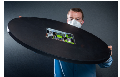
DiskSat is a plate-shaped satellite, 1 m in diameter, 2.5 cm thick.