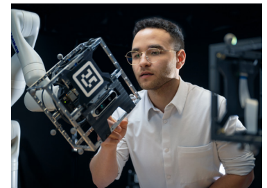
A VSD engineer is leading the effort to mature a testbed to support emerging rendezvous, proximity operations and docking (RPOD) technologies.