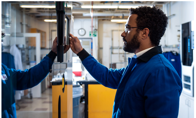
In the Additive Manufacturing Laboratory, an Aerospace scientist studies the relationship between the processing, structure, properties, and performance of 3D printed parts.

Building on its early success, UPLIFT has recently been expanded to include all Aerospace technical disciplines. While the primary goal is to facilitate connections between outstanding talent from historically underrepresented groups and Aerospace professionals, UPLIFT also offers career development and recruitment opportunities for participants.