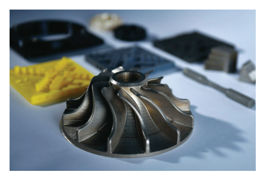
Aerospace is testing a variety of materials for additive manufacturing of space parts both on the ground and on orbit.