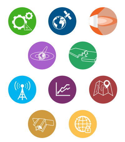
The engineering, science and technology Hubs are broad, discipline-spanning organizations aligned with customer needs.