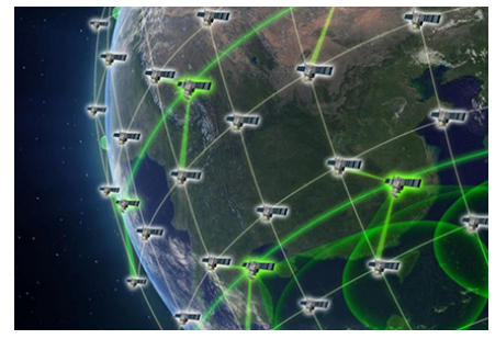
Artist's concept of the Blackjack constellation on orbit.