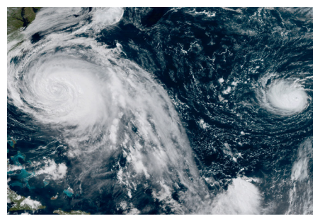
Project NOAA Data Analytics is working to increase the resilience of severe weather models based on complex data inputs.

DARPA's experimental low earth orbit (LEO) satellite constellation program, known as Blackjack, is an architecture demonstration intending to develop and demonstrate the critical elements of a global high-speed network in a LEO constellation. In addition to providing highly connected, resilient and persistent coverage, Blackjack's mission includes the demonstration of payloads to augment existing national security space assets in LEO. Key to the Blackjack objectives are payload- and mission-level autonomous, robust and resilient capabilities for orbital operations. Pit Boss, the autonomous subsystem for these operations, is intended to develop autonomy, integration, on-orbit cyber security and on-orbit cryptographic solutions for the Blackjack constellation. As the independent trusted advisor to government, Aerospace is providing independent evaluation for the Pit Boss source selection, helping to identify concepts most likely to succeed in solving DARPA's defined "hard problems."