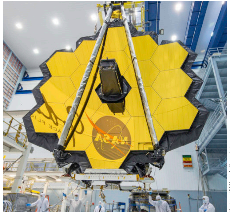
The James Webb Space Telescope